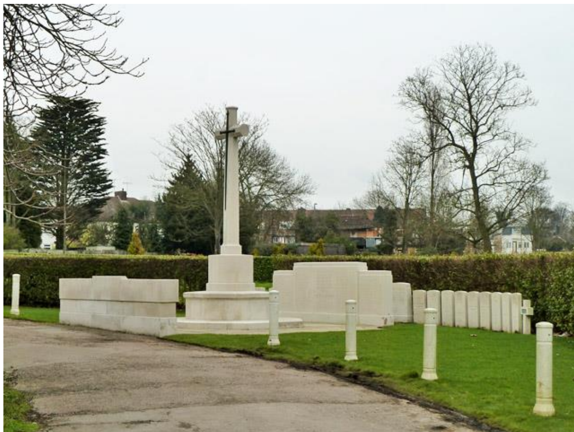
Cross of Sacrifice Hendon Cemetery