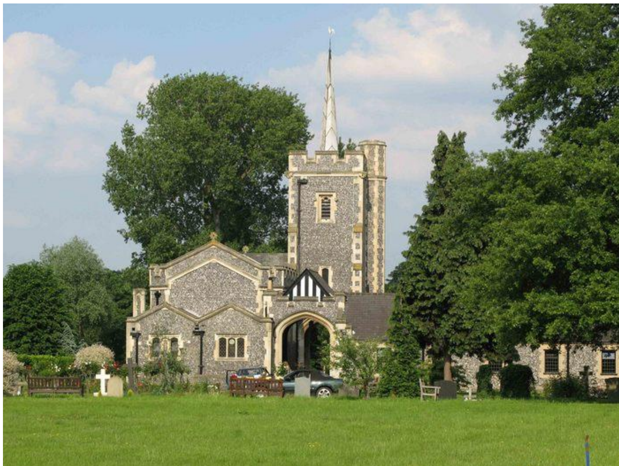
Hendon Cemetery